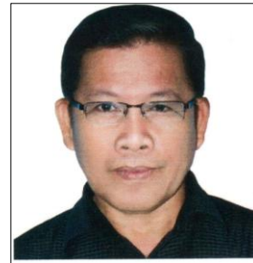
AVELINO N. AGUSTIN, JR. Municipal Mayor